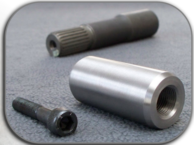
▲ T-8200AC in the foreground with an output shaft for reference.